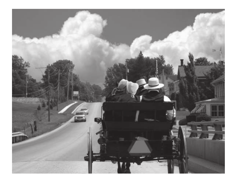
Image of the Amish travelling in a courting buggy on a road in Pennsylvania

The Amish are a religious community in Pennsylvania, USA. Their strict religious beliefs mean they reject some features of modern lifestyles, like the motor car. Individuals who do not conform to the norms of the group can face ostracism by their community. The Amish have become a tourist attraction because their way of life is so different. There can be conflict between them and the tourists as their religion means they are not happy to be photographed.